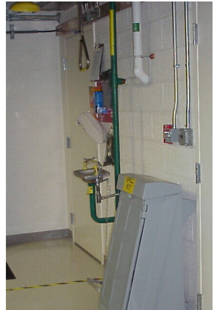
Figure 4. Eye Wash / Shower Station in Background

At the "end of the day," local operations personnel must be able to meet ongoing battery maintenance and monitoring needs, and the site management team must have confidence that the battery systems will perform as expected, when needed!