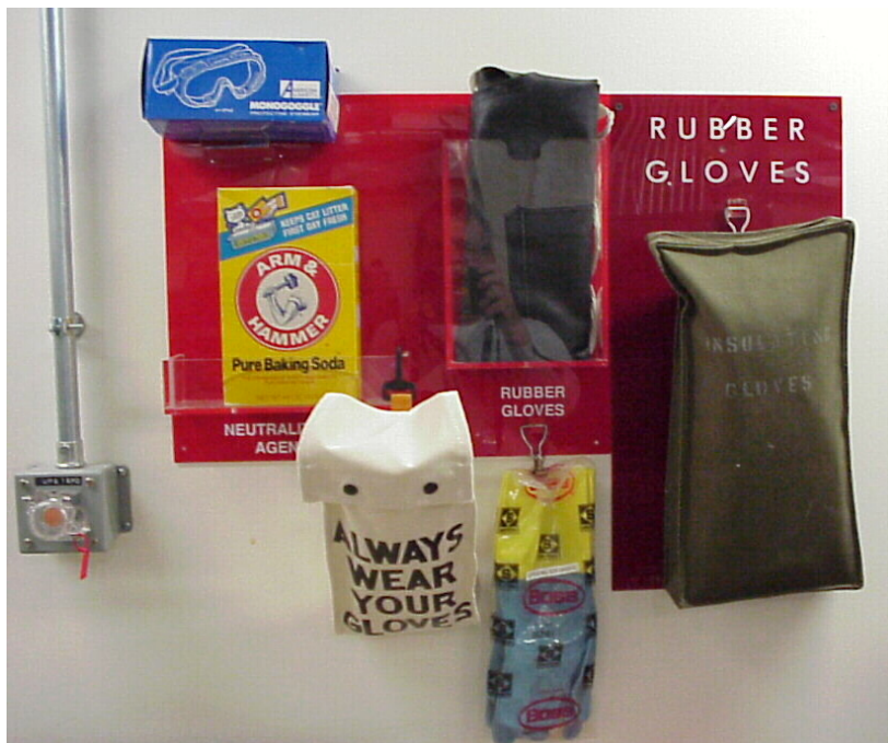
Figure 2. Emergency Power Off (EPO) Device

An EPO device should be located at all egress points from the room and be tied into the central alarm system and monitored.