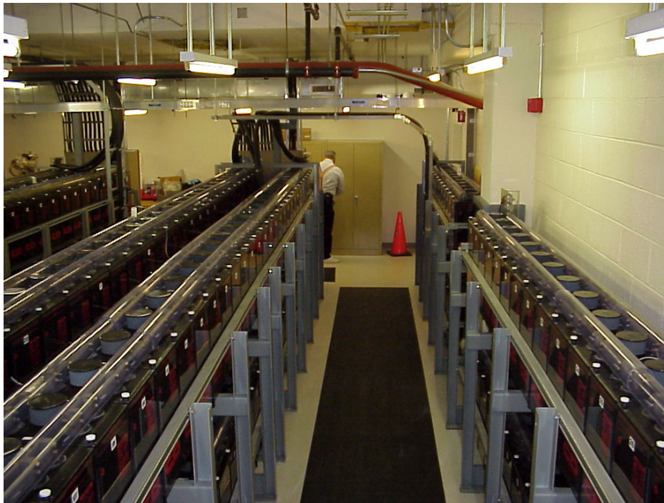
Figure 1. Battery Rack And Structural Issues

While extensive, expensive reinforcing of structural elements is usually required to accommodate heavy battery loading in renovation projects, building floor slabs, columns, and footers in new construction can be much more easily designed and constructed.