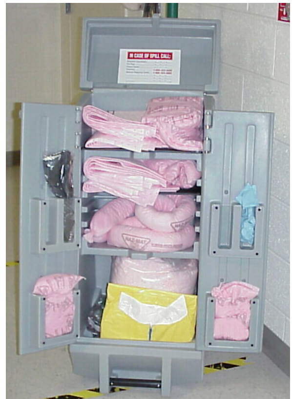
Figure 3. Spill Containment/Cleanup Kit

Code required spill containment must be provided to adequately contain potential acid spills from cracked or otherwise leaking flooded wet cell batteries. Localized under-rack containment systems can be utilized or a whole room containment concept can