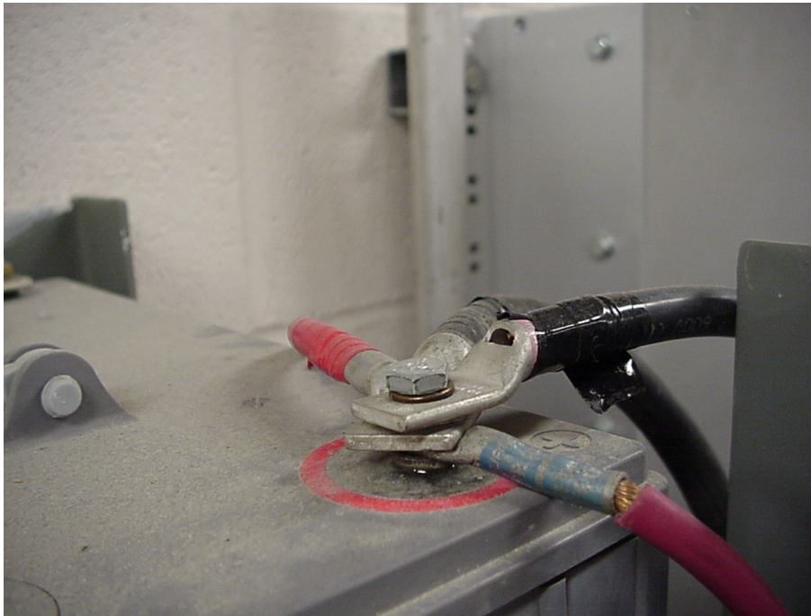
Figure 1. Battery terminals should not be the center point of a DC system!

Most DC systems have more than one load and therefore should have a main DC panel. This should normally be the center point of the DC system. All DC power sources, battery or batteries and all chargers should feed into the main DC panel. All loads should feed out from the main DC panel. Such designs allow major components of the DC system to be repaired or replaced without performing energized work. The battery or batteries and the chargers will likely be replaced during the operational life of this DC system; therefore, the charger output terminals or the positive and negative battery terminals should never be the center tie or connection point for the DC system.