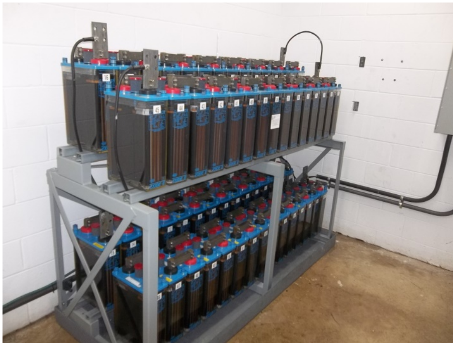
Figure 3. 2-Tier 2-Step Rack

Cell Mounting: VLA and NiCd cells are typically mounted on open racks which allow easy access to the individual cells or jars. Multi-tier racks are preferred instead of Step racks as Step racks require workers to lean over the energized intercell connections on the front step to reach the cells on second and subsequent steps. Cell replacement is also far more difficult on Step rack verses multi-tier racks.