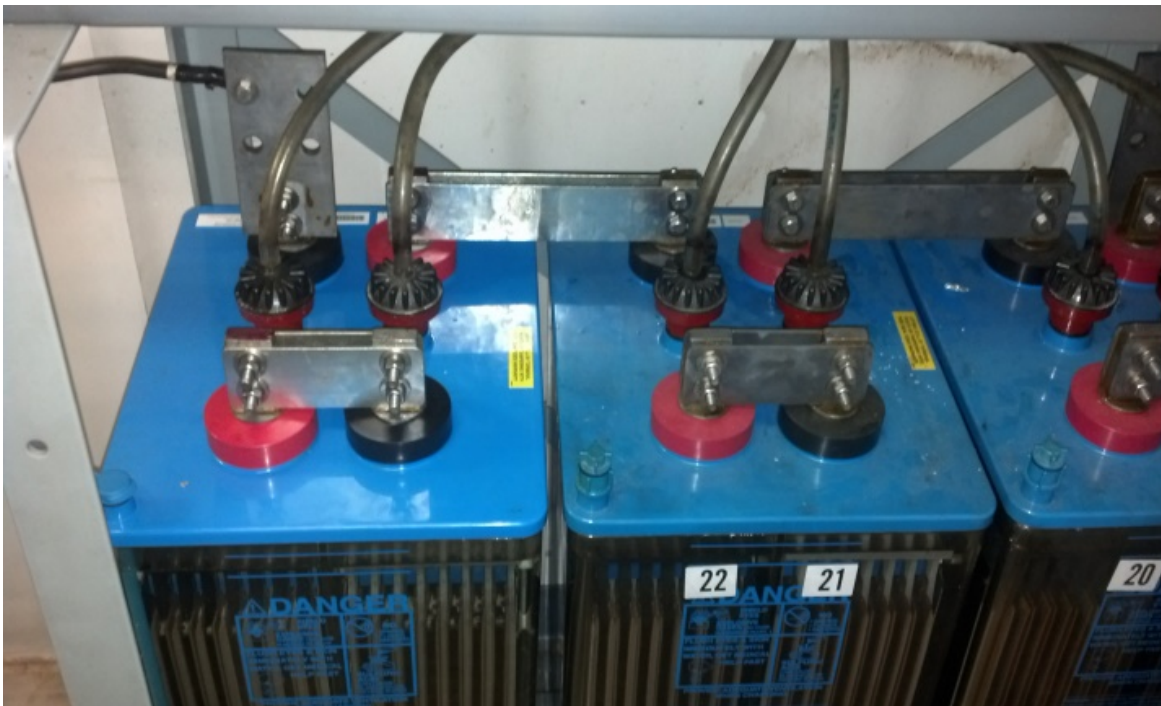
Figure 4. Manifold Vent System

Manifold Vent Systems: Manifold vent systems are ventilation systems where the vent of each cell is connected through a manifold system and the hydrogen and oxygen gases are collected and vented outside the building or enclosure.